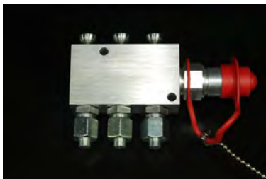
Multi-way valve MV 3 Ref.No. 3240

The Multi-way valve MV 3 allows to operate up to three HSBL units* with only one power pack without having to change the hydraulic connection. By simply switching, you can select the desired processing of your current busbar. This enables a fast and uncomplicated work.